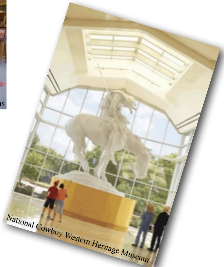
National Cowboy Western Heritage Museum