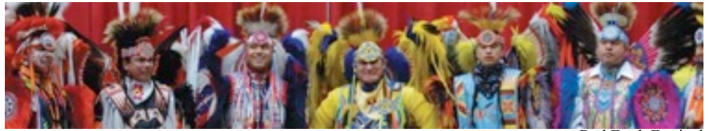
Red Earth Festival

For visiting scholars and others who are new to the area: Explore opportunities outside the Collections by clicking links for the following sites in the pdf version of this guide. (* = top 10)